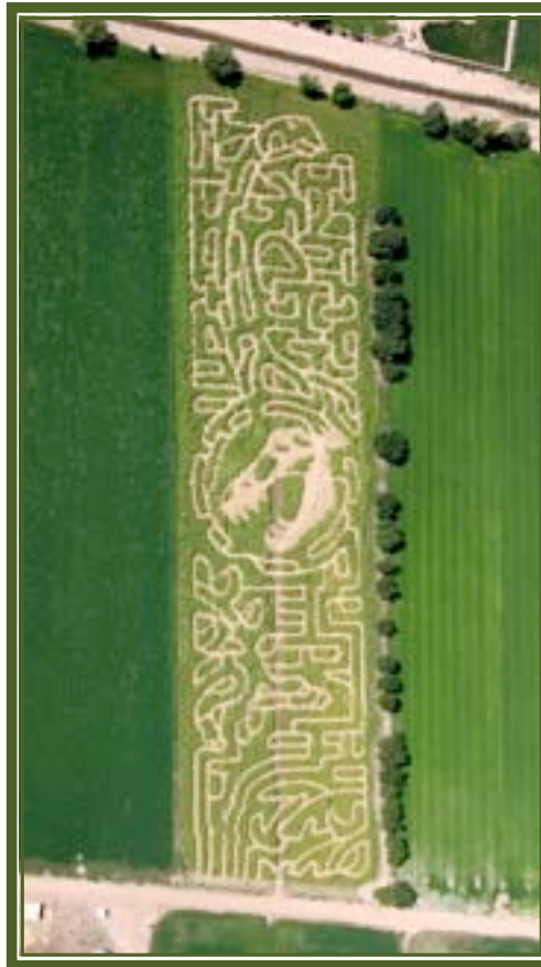
2011 "Dino" Maize Maze